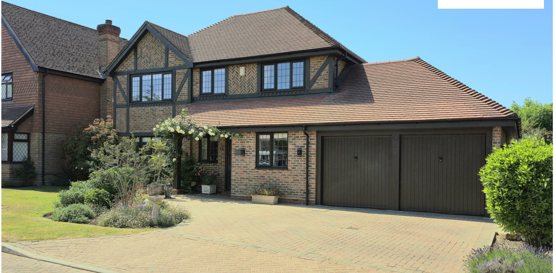
Ripple Wood, 13 Ripley Way, Epsom, Surrey, KT19 7DB